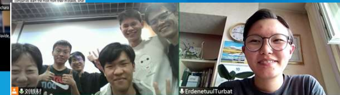
Tsinghua GHC classes