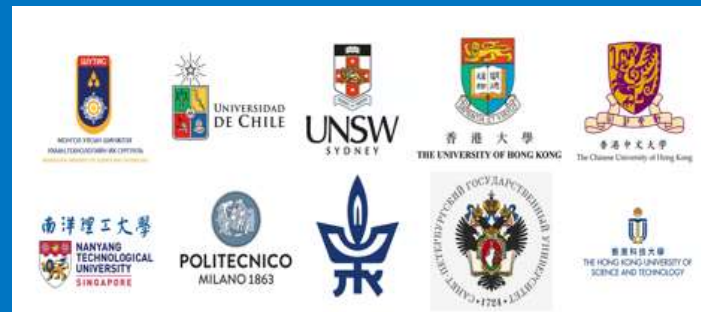
A Glance at Our Partners